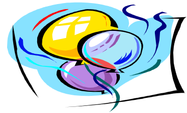
The clubhouse is yours to rent for special

For clubhouse reservations or questions, Olivia can be reached at 303.635.1878.